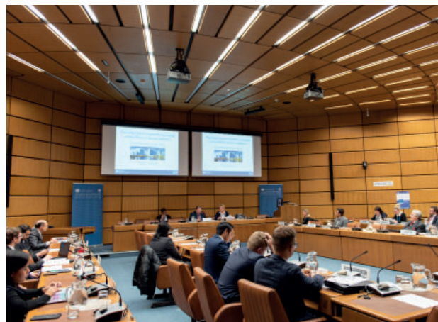
Participants and panellists at the UNSCEAR briefing to Representatives of Permanent Missions accredited to the United Nations (Vienna), held at the VIC on 9 December, 2019.